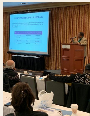
February 18, 2019, CTPF hosted two Retirement Seminars at the Hilton Oak Lawn for members considering retirement in June 2019.