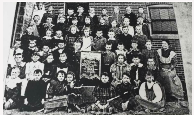
Blaine Elementary school in 1895, the year CTPF was founded.

As part of the 2020 celebration, the Fund is seeking photos and memories/reflections of CTPF educators, with a goal of obtaining a photo from each of the past 125 years. Do you have a photo of yourself at work in your classroom or work space? Or even a parent or grandparent? Please