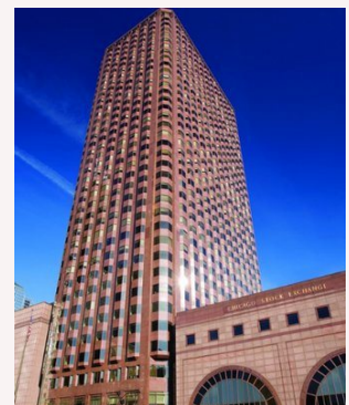
425 South Financial Place

CTPF has established a dedicated webpage at ctpf.org/onthemove which will be updated regularly with additional information.